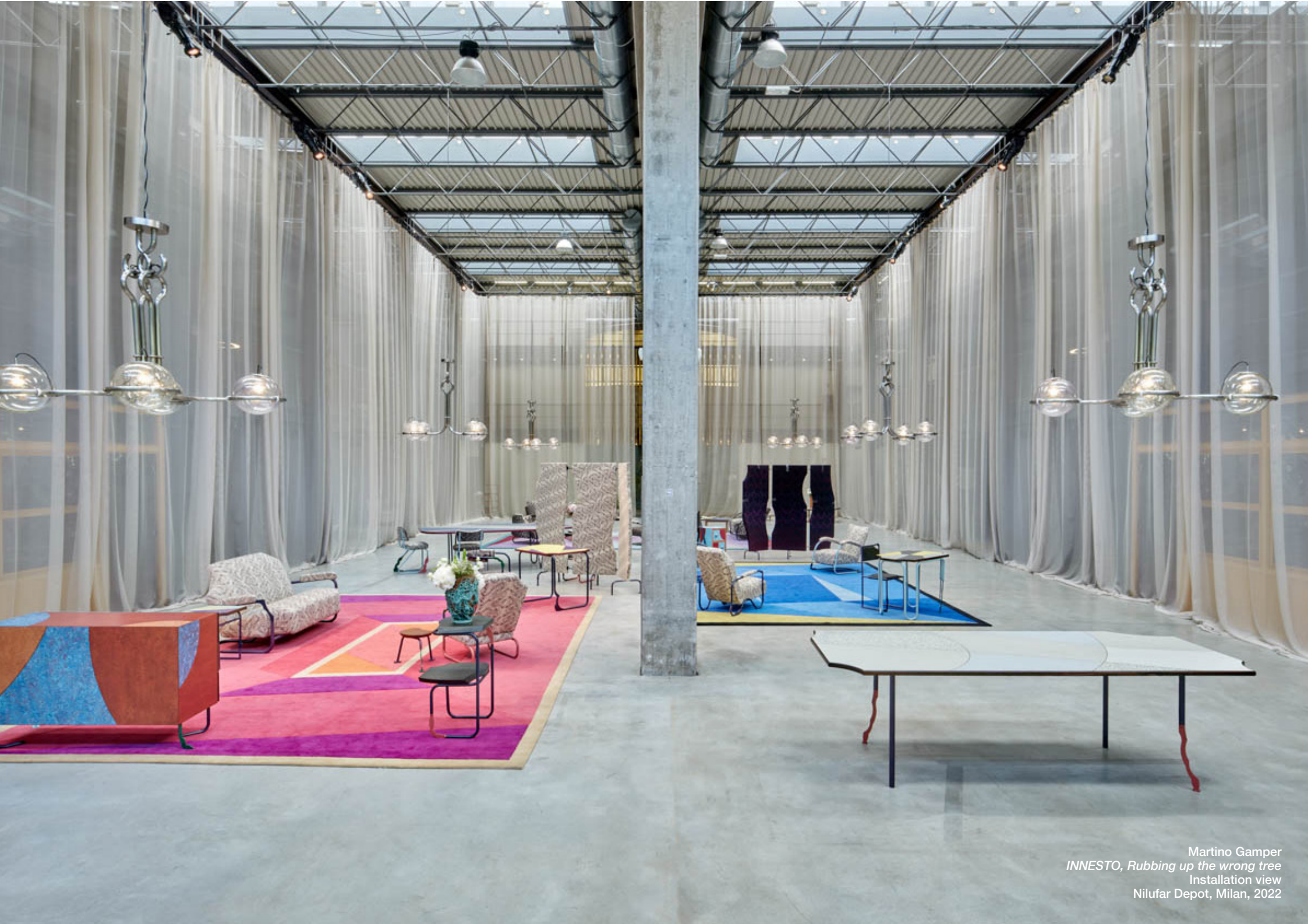
Martino Gamper INNESTO , Rubbing up the wrong tree Installation view Nilufar Depot, Milan, 2022