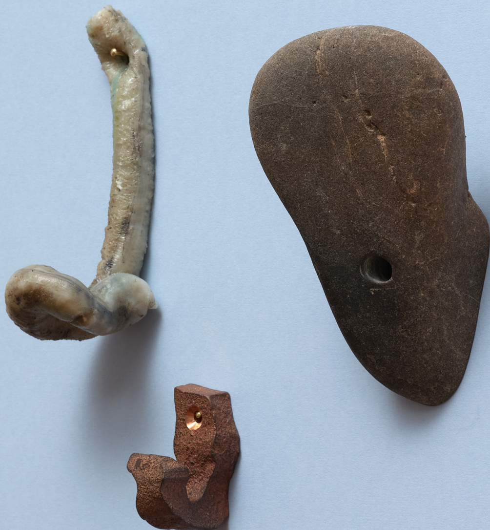
Martino Gamper Hookaloti Group #11 recycled plastic, copper, graywacke stone 160 x 50 x 72mm, 65 x 32 x 47mm, 180 x 95 x 50mm Michael Lett Auckland, 2022