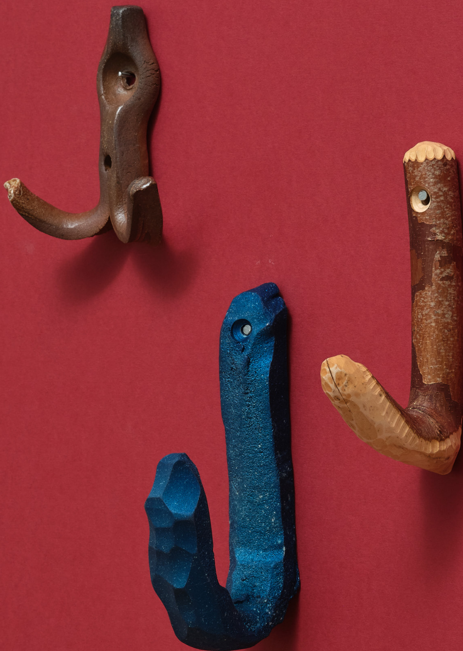
Martino Gamper Hookaloti Group #2 stoneware, anodised cast aluminium, hand-carved wood 120 x 95 x 50mm, 180 x 33 x 93mm, 163 x 27 x 93mm Michael Lett Auckland, 2022