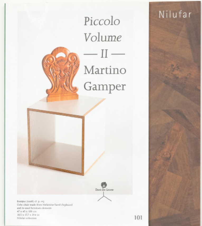
Martino Gamper Piccolo Volume II 2022 Published by Dent de Leone