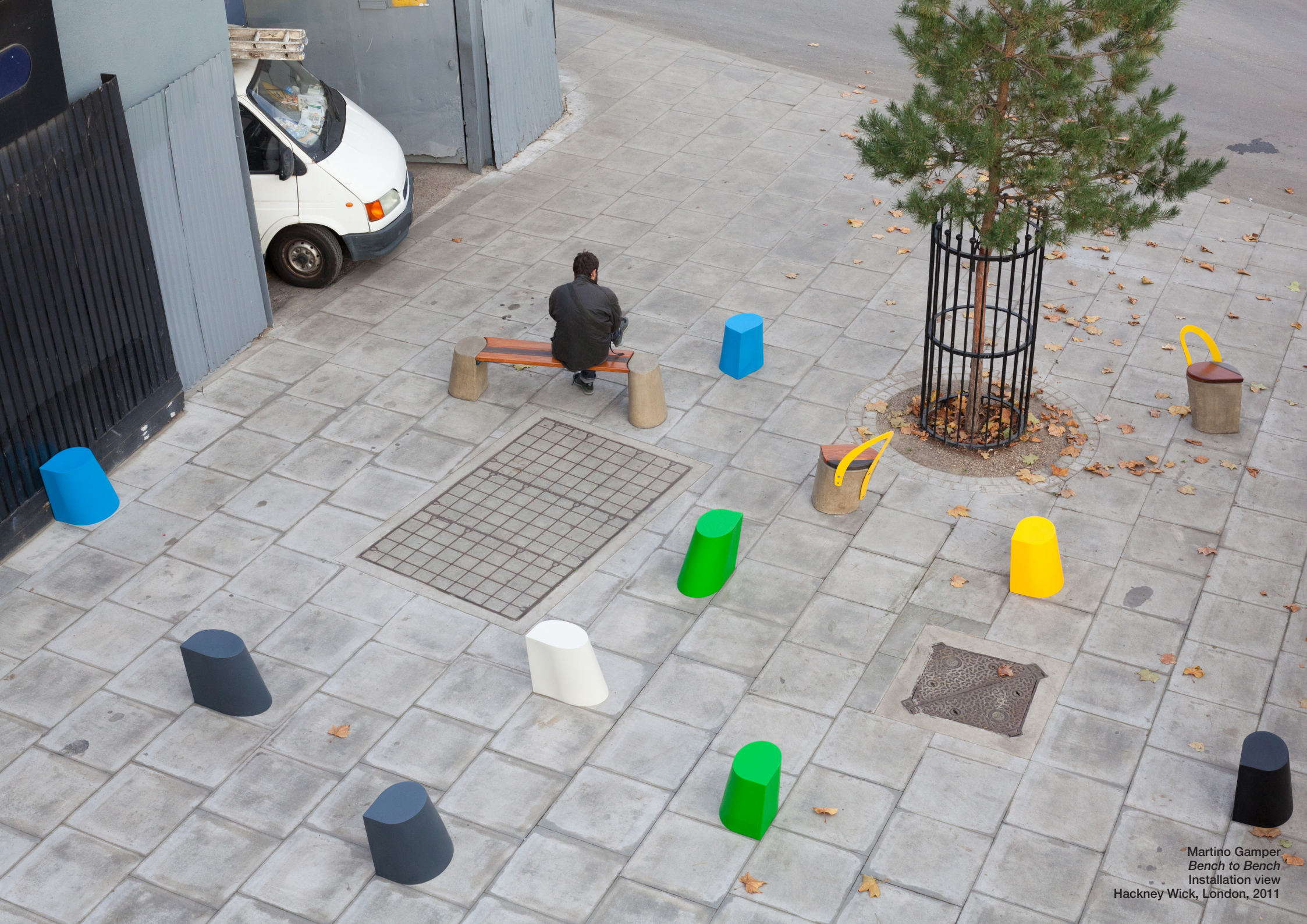
Martino Gamper Bench to Bench Installation view Hackney Wick, London, 2011