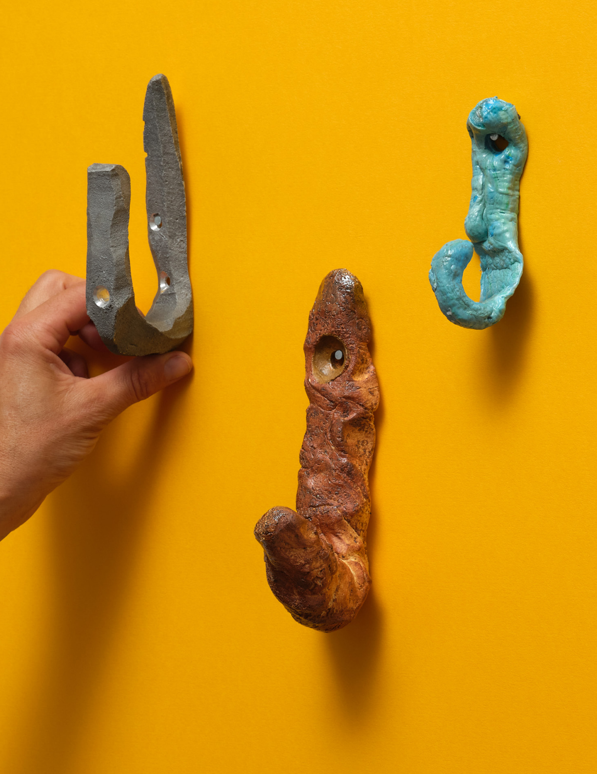
Martino Gamper Hookaloti Group #8 cast aluminium, stoneware, recycled plastic 155 x 30 x 70mm, 200 x 50 x 95mm and 115 x 40 x 45mm Michael Lett Auckland, 2022