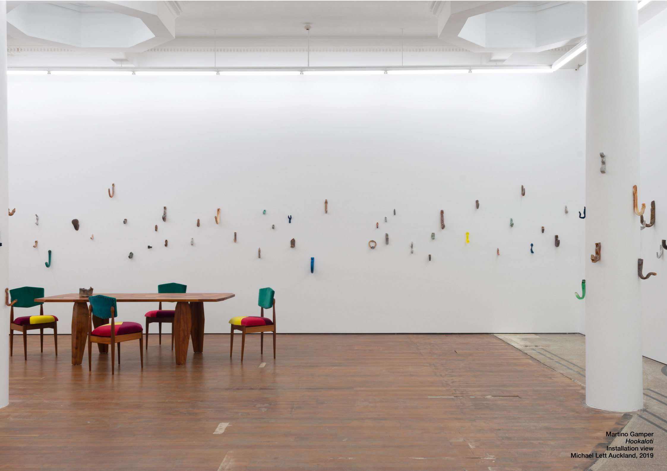
Martino Gamper Hookaloti Installation view Michael Lett Auckland, 2019