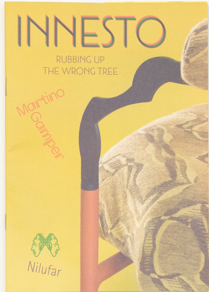
Martino Gamper Innesto: Rubbing up the Wrong Tree 2022 Texts by Francis Upritchard and Adam Hills Design by Åbäke